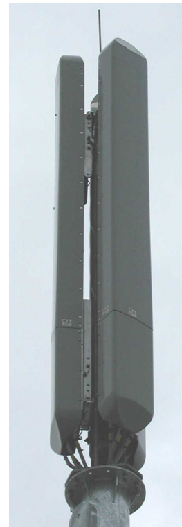
Shown with optional ASC enclosure